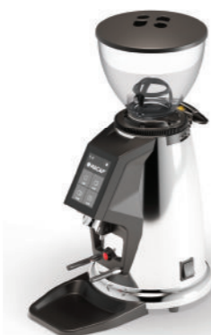
● F4 OD Chrome

The F4 series models are manufactured from die-cast aluminium and finished in black, silver or polished chrome. The On Demand models feature a digital display allowing easy grind dose selection and adjustment.