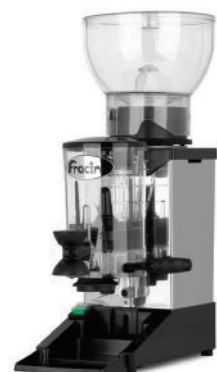
● Model T

Easily adjusted grinder burrs and integrated dispenser hopper for the ground coffee ensure simple, consistent operation and accurate portion control. Coffee is dispensed into the filter holder using the flick lever mechanism.