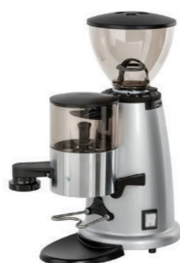
● F4 Auto Silver

The F4 series models are manufactured from die-cast aluminium and finished in black, silver or polished chrome. Fitted with an integrated die cast dispenser, to suit different user requirements.