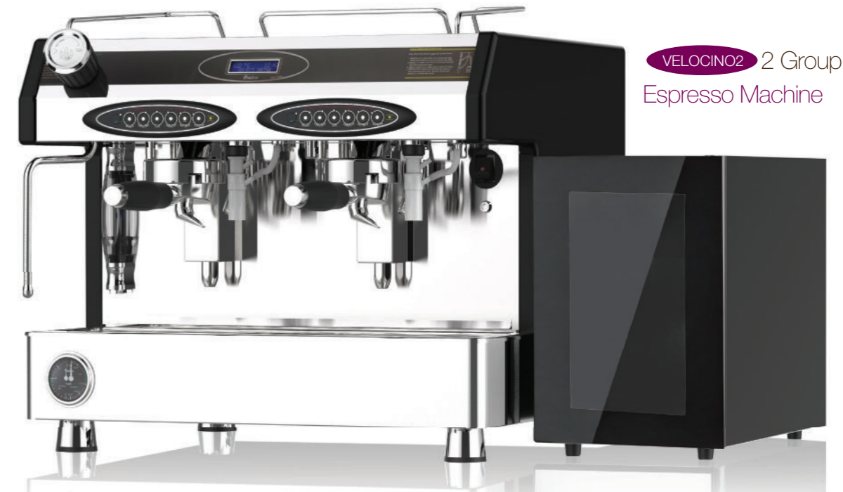
VELOCINO2 2 Group Espresso Machine