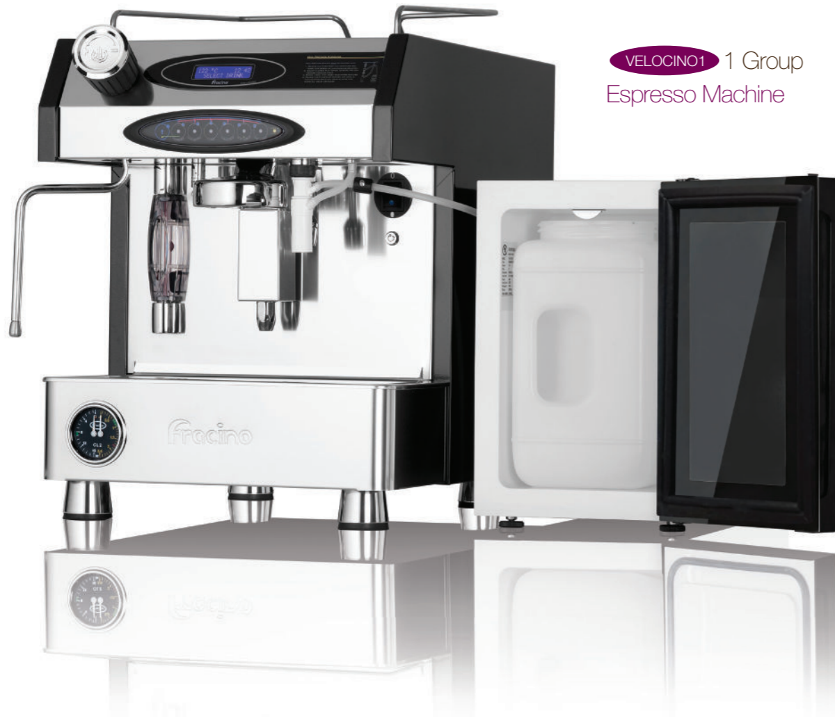
VELOCINO1 1 Group Espresso Machine

Introducing, the Velocino by Fracino, the state of the art hybrid espresso machine which pairs the convenience of a bean to cup machine, with the simplicity of a traditional espresso machine. Manufactured from the highest quality stainless steel, brass and copper components, it is a reliable and simple to maintain espresso machine, built to last a life time. This no nonsense new innovation has been specifically designed for sites with a high staff turnover, ensuring consistent, premium quality drinks each time, no matter how inexperienced the operator is. Combining the traditional E61 style chrome plated brass group with an automatic milk frother, advanced programming and an easy to understand control panel, the Velocino allows you to dispense all espresso based drinks straight into the cup at the press of a button.